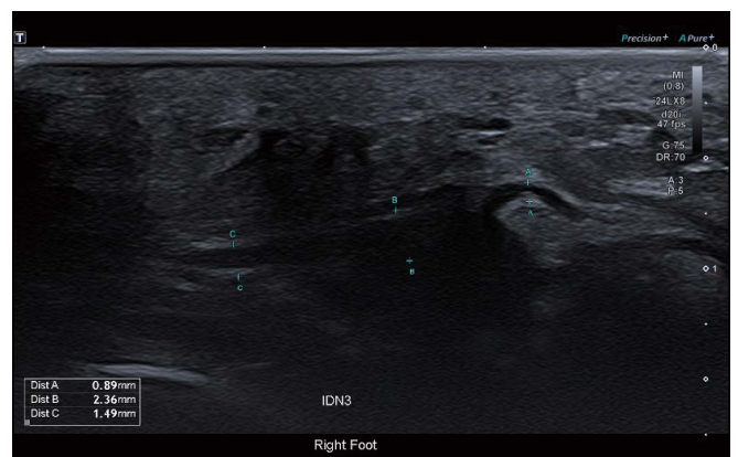
Figure 2 Imaging of the interdigital nerve shows slight thickening of a small section of the nerve. At its narrowest it measures 0.9 mm with focal thickening to 2.4 mm, suggesting possible neuroma.