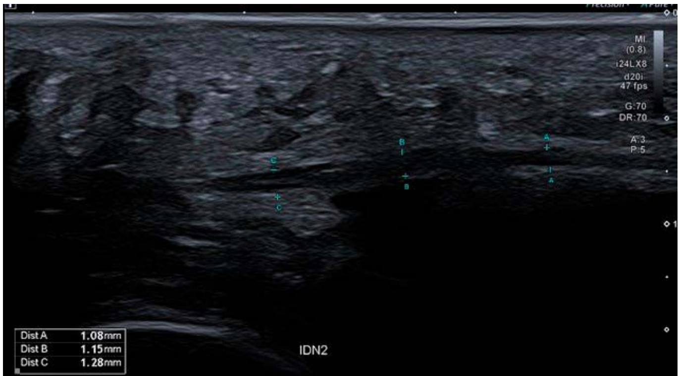
Figure 3 A normal/non-thickened interdigital nerve.