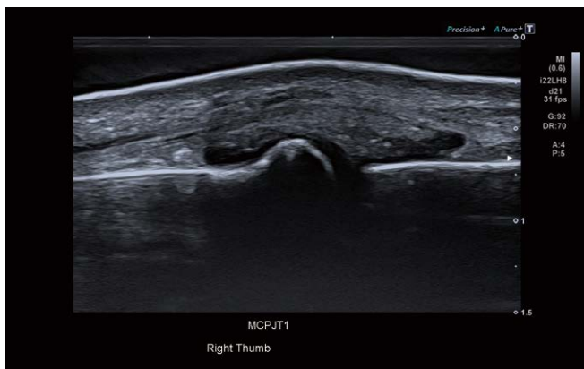
Figure 1 Imaging of the MCP Joint clearly demonstrates fluid emanating from the joint.

An ultrasound examination was performed on the Canon Aplio i800 / Prism Edition system using a 22 MHz ultra-high frequency hockey stick transducer (PLI-2002BT). A full thickness tear of the radial collateral ligament (RCL) and an avulsion fracture of the first metacarpal joint were visualized. Ultrasound findings also suggested a partial thickness tear of the ulnar collateral ligament (UCL).