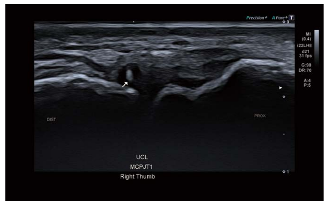
Figure 2 Imaging of the UCL shows an echogenic area at the distal portion of the ligament. Findings are suggestive of a partial tear.