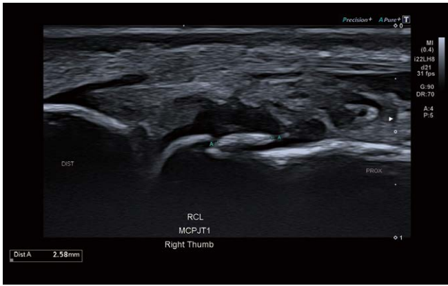
Figure 3 Imaging of the RCL of the thumb shows a 2.5 mm echogenic area at the proximal portion of the ligament suggestive of an avulsion fracture.